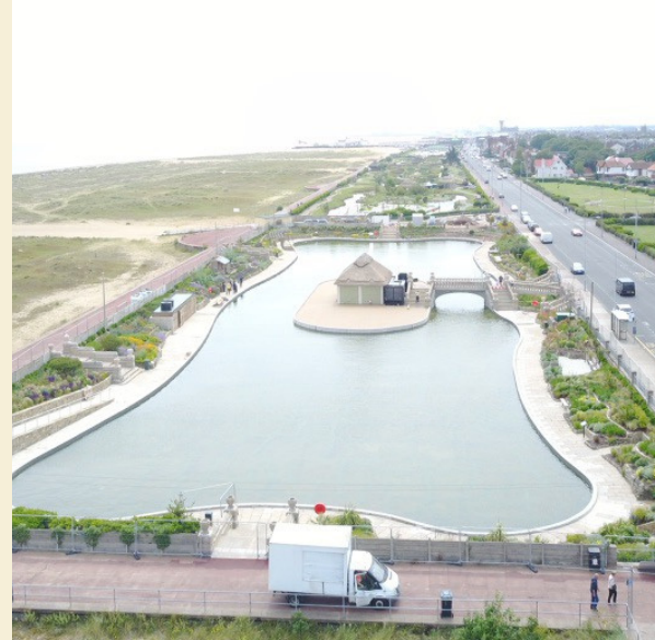
The Venetian Waterways In Great Yarmouth Befeor & After